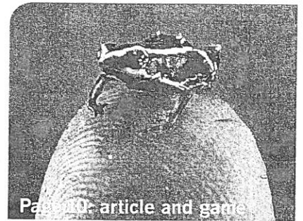
Page 10: article and game